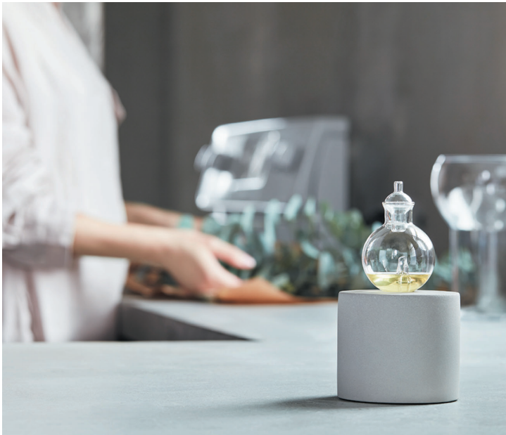
Living / Dining