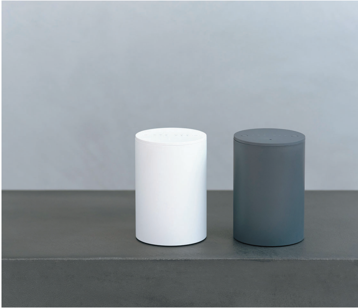
White or Gray