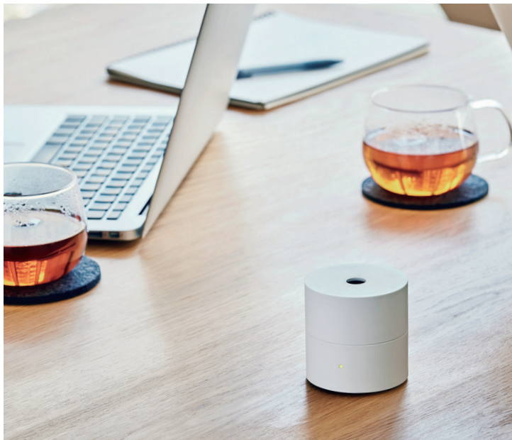
Desk and meeting spaces