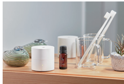
Entrance and washroom