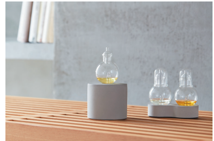
With flask stand (sold separately)